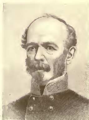
JOSEPH E. JOHNSTON.